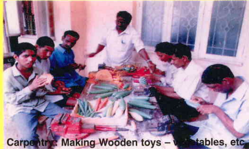
Carpentry: Making Wooden toys – Vegetables, etc

Children are taught Alphabet, Arithmetic, concept formation, drawing and painting, self-help skills, general knowledge etc. as per their capability to learn.